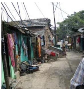
A street in the slums of Kolkata, India. The Leprosy Mission is working to educate and improve their quality of life.

"He is a leprous man, he is unclean," says Chapter 13 of Leviticus.